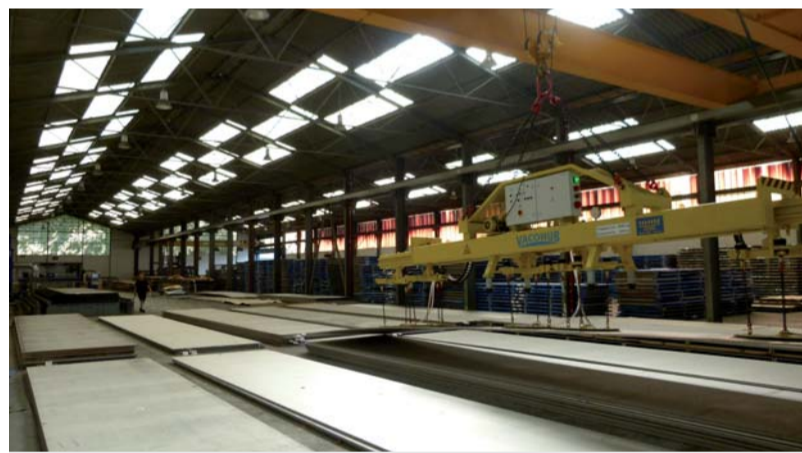
12-metre-long quarto plates in the company's warehouse

mill, but we would have to wait six weeks, which we can't this time, so we will buy the product directly from you.' It is therefore essential for us to be very fast, have all the materials always in stock and process orders within 24 hours. As our customers realise that they can always rely on us, they feel more and more comfortable about placing their orders last-minute, which makes their purchase decisions less stressful and more cost-efficient as they buy exactly what they need."