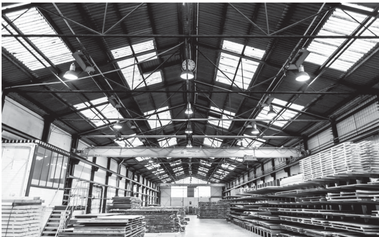
HW-INOX warehouse measuring 10,000 m 2 and storing about 8,000 tonnes of quarto plate