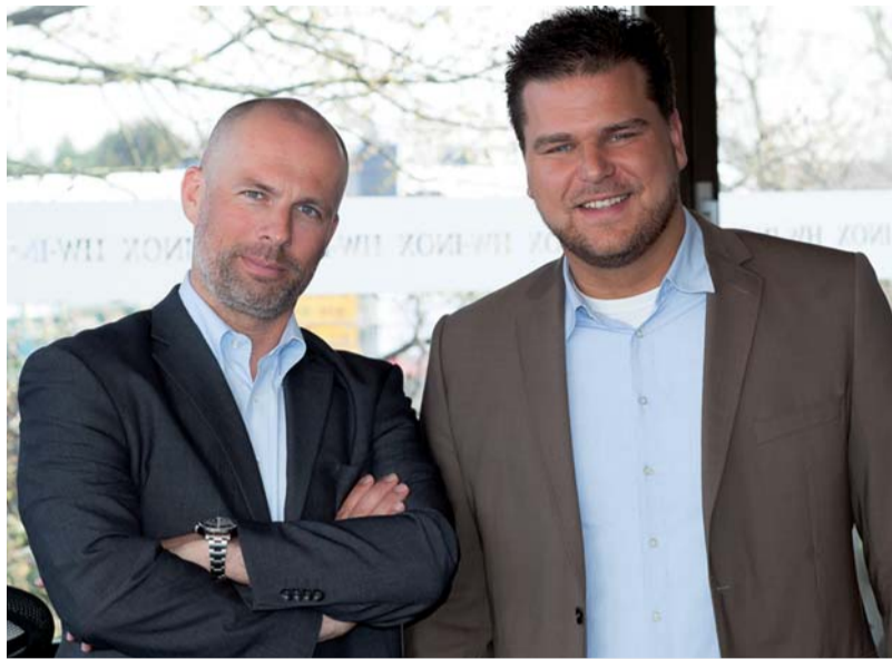
Members of the HW-INOX domestic and export sales teams