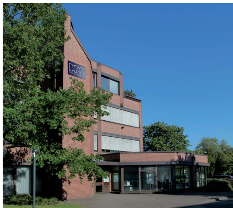
HW-INOX head office in Ratingen (near Düsseldorf)

Thorsten Huch elaborates: "In the last two years we have expanded our stock program in all directions. We have added thicker materials to our stock, but also carry thinner materials than previously. We have also invested in plates that are quick movers, to increase the possibilities for our customers to buy what they need from us. What makes our portfolio particularly unique, however, is a combination of standard and special thicknesses, dimensions and grades. Speaking of thickness, a lot of traders stock materials measuring up to 12 mm, while others go higher but limit their stock to standard thicknesses such as 15, 20, 25, 30, 35 and 40 mm. What sets us apart from most of our competitors is that, in addition to standard thicknesses, we also carry quarto plate in non-standard, in-between thicknesses such as 16, 18, 22, 28, 32, 36 mm and higher up. There are a number of big cutting companies in Europe which deal in quarto plate. If they store thicker materials, they typically carry 60, 70 and 80 mm. But we also offer 65 and 75 mm, for instance, which are materials that give