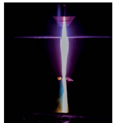
HW-INOX can cut quarto plate to custom dimensions in-house.

Also very important is that we are independent and this is a great advantage for our customers as independence makes us flexible in buying material. We are in close contact with seven to eight mill suppliers, so every month we are able to decide what tonnage we buy from which company. We are not dependent on one manufac-